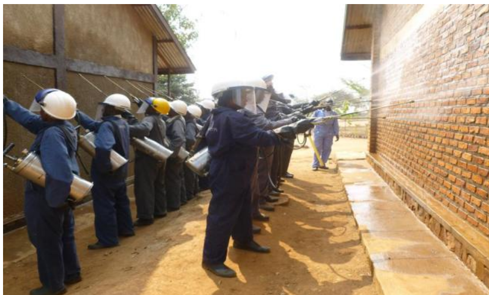
Figure 2: IRS Practical Training Session

After the ToT, the participants were allocated to different training sites in the IRS target districts to conduct IRS training for SOPs and Team Leaders (TL). The number of trainers deployed to each of the training sites was based on the number of participants to be trained at each of the training sites. The numbers of the ToTs are shown in Table 6 above.