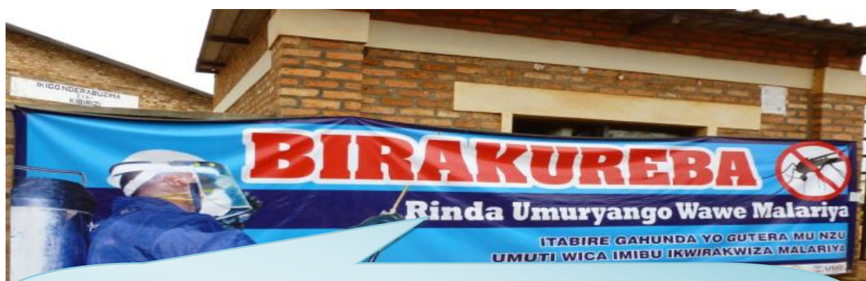
Figure 3: IRS Banner at Kibirizi Health Centre, Gisagara District